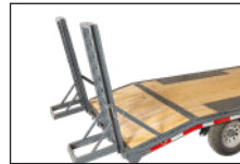
Stand Up Ladder ramps