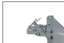
2 5 / 16 " Adjustable coupler