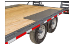
Full Length Rub Rails With Stake Pockets