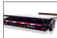
3' ADJUSTABLE BEAVERTAIL WITH 5' SLIDE IN LADDER RAMPS