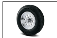
ALUMINUM MOD WHEEL/TIRE