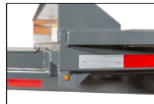
Grommet Mounted LED Lights