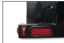
Grommet Mounted LED Lights