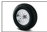
ALUMINUM MOD WHEEL/TIRE