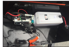
Bucher 12V Hydraulic Power Unit