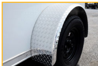
Heavy Duty Diamond Aluminum Plate Fenders