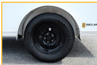
Black Steel Wheels